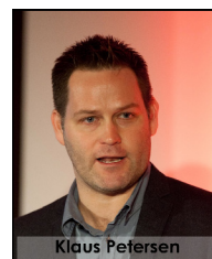
Klaus Petersen Solar Group